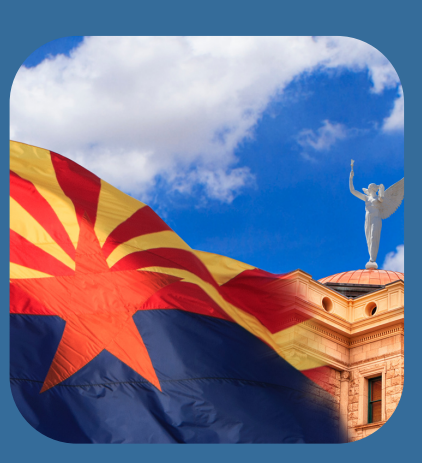
-Senator T.J. Shope

We've had a number of important Senate Republican bills recently signed, including several of mine. SB1067 gives the Department of Child Safety authority to investigate allegations of abuse or neglect in group homes. SB1021 will help bring more health care options to underserved communities by eliminating an unnecessary process that stifled these efforts. Senator Gowan's SB1173 will help with the shortage of mental health providers in our state by increasing access to counseling services and allowing out-of-state counselors to practice in Arizona. Senator Shamp's SB1404, which was vetoed by Hobbs last year, requires schools to be informed of any parents of students currently enrolled who are registered sex offenders. Additionally, SB1235 creates a Child Safety Fatality and Near Fatality Review Team under DCS, in an effort to provide lawmakers with accurate data to help create policy aimed at preventing future avoidable tragedies. To see a full list of signed bills so far, <u>click here</u> and select "Signed by Governor" in the drop-down menu.